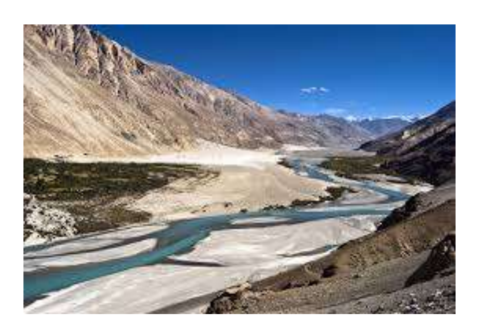
Sindhu (Indus) River

The Tribune- another Pakistani Daily on October 1, 2016 wrote that shortly after such threat issued by India, China too on its part blocked the water of a tributary river of the Brahmaputra. The Diplomat, another Daily on September 30, 2016 wrote although China dubbed the of blockade of water at Lalho hydroelectricity project just as a technical act and made it clear that it (China) would not block water from the Brahmaputra River to India, it was a balanced symbolic gestural response to India for its treatment against Pakistan. It goes ahead to write that just in case India takes any move against Pakistan contrary to the Sindhu River Water Treaty, China will feel pressed to adopt similar policy against India.