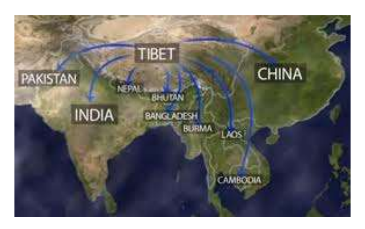
Tibet as water source of many countries

On the other hand, the occupation of Kashmir by India has become a never ending conflict in the global war history. To everyone's dismay, Killing of Indian and Pakistani has now become no surprise. In fact it is a fight of ego clash, in my opinion. Indian Army and Ministry of Defense on 29 Sep, 12016 claimed to have blown off seven terrorist hotspots and gunned down several terrorists in a surgical strike (according to the Indian version) in Pakistan controlled Kashmir. In a context Indian Prime Minister Narendra Modi with a warning remarked, 'Because blood and water cannot flow at the same time, India according to treaty of sharing of water cannot by any means let Pakistan use it'. Indian media had done much hype of court's directive of postponement of usual meeting about water sharing from the Sindhu River. To disallow Pakistan from use of water would not just go against the spirit of the water treaty of 1960 in mediation of World Bank but also violate the practice of international law, something akin to announcement of war against Pakistan, Dawn-a Pakistan Daily wrote on 27 September referring to Pak foreign policy advisor and veteran statesman.